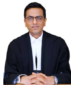
Next Chief Justice of India D Y Chandrachud

On October 16, 2019, when the Chief Justice Ranjan Gogoi read out the unanimous verdict on Ayodhya case, something that aroused as much curiosity as the judgment by five-judge Constitution bench of the Supreme Court was its authorship. In a departure from convention, the judgment did not carry author's name. But as the experts found, some vital clues emerged: the language and structure of the 929-page document, broken down into chapters, bore the mark of D Y Chandrachud. Almost all its judgments, they pointed out, be it Aadhar, right to privacy or Sabrimala, followed that pattern.